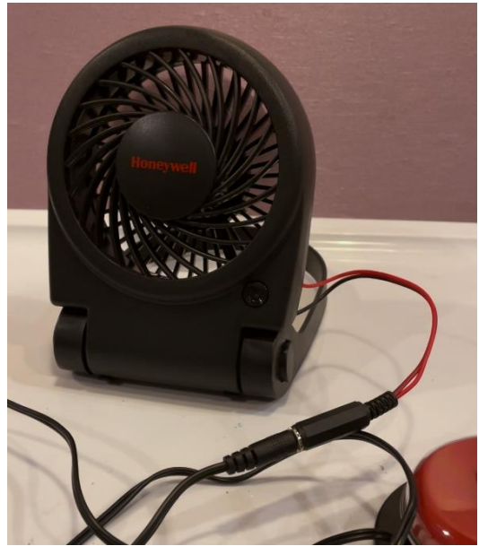
Toy with a standard jack