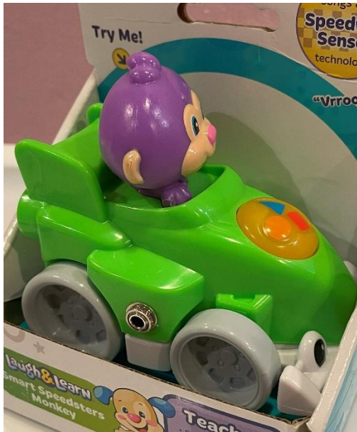
Toy with a mounted jack